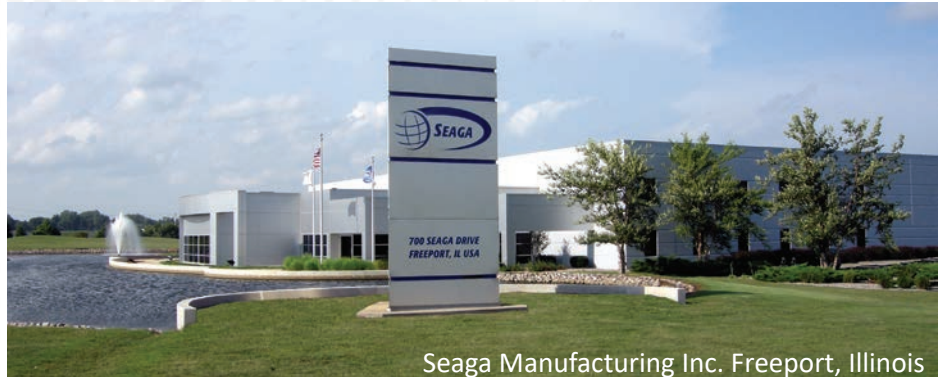
Seaga Manufacturing Inc. Freeport, Illinois