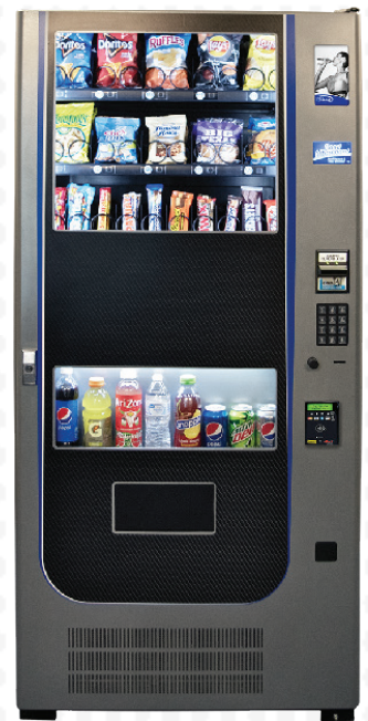
*Shown w/Graphics Option A