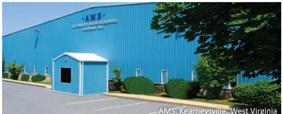
AMS, Kearneysville, West Virginia